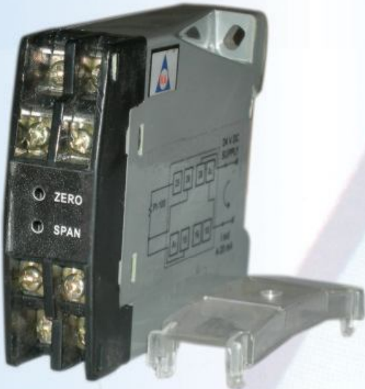
DIN RAIL MOUNTING TYPE

The PTX-100 is excellent & cost-effective 2-wire Temp. Transmitter. The design is available in HEAD mounting & DINRAIL housing. The Device generates 4-20mA current signal Proportional to temp. The TRANSMITTER Operates on loop power supply. The current Signal reduces wiring cost drastically. The Effect of electrical noise is minimized & long runs of Thermocouple wires is eliminated. The Housing is shockproof & hermetically sealed.